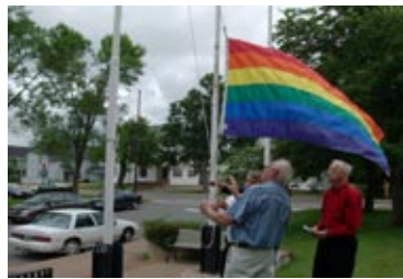
Flag raising at Amherst Town Hall