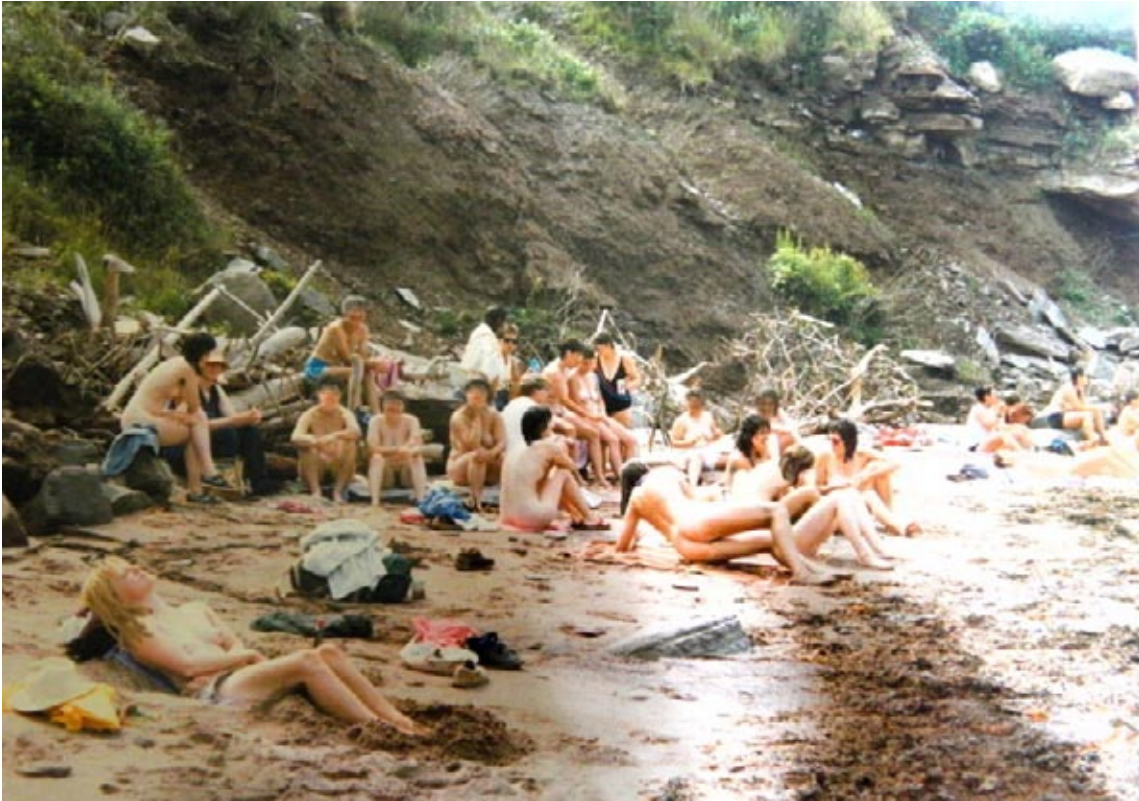
A beach trip during The Third Annual Wild Women Don't Get the Blues, 1985. We climbed down a steep cliff behind a church to a private beach on the North Shore just past Toney River, we picked some mussels, then steamed them on this beach. We had body paint and that a light plane found us somewhat interesting and passed by a few times.