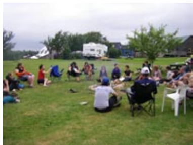
Morning introductions and discussion around the campfire.

Camp Out! would like to thank all the volunteers, participants, presenters, musicians, and sponsors who helped make the event a wonderful success. Camp Out! took place July 17 – 19, 2009 at The Mermaid and the Cow campground in Pictou County, NS. Attracting over 30 participants from all over the region, ranging in ages between 7 and 70 and representing diverse backgrounds, the event celebrated and explored LGBTQ activism in the Maritimes.