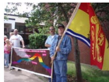
River of Pride delegation at Amberst flag raising

For further information or any clarifications on these positions and