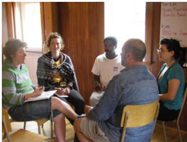
Small group discussions at the West Branch Community Hall

By all accounts Camp Out! met and exceeded expectations as an effort to bring diverse members of Maritime LGBTQ communities together. We saw the power of face-to-face interactions in establishing real dialogue, and to bridge gaps created by age, race, gender and urban versus