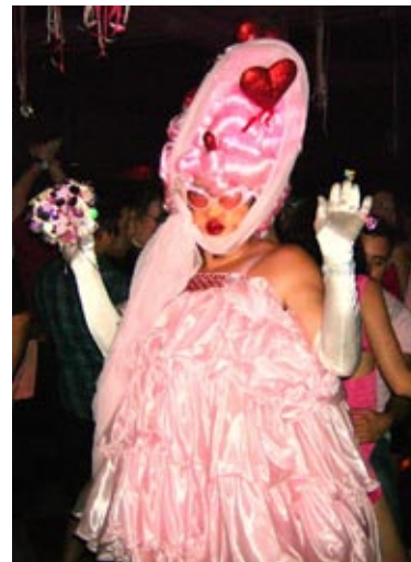
PINK LADY electrified the pink party

A committee meeting was held shortly after Pride X wrapped, to