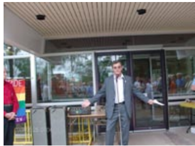
Amherst Mayor Rob Small