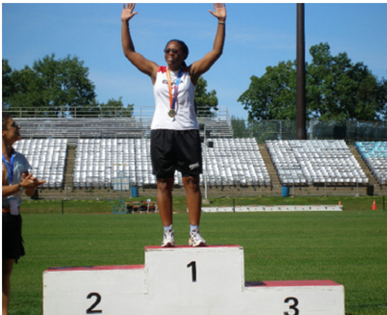
Gold at the 2006 Outgames in Montreal