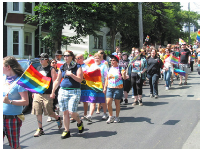
St. John's 2010 Pride Parade.