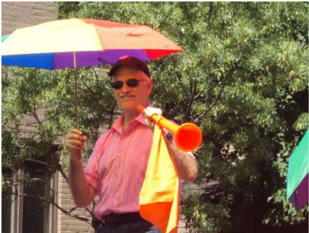
Jack Layton dances on a float in the Toronto Pride Parade 2010.

It's hard to say it any better than Jack did, so I'll end with his words: "My friends, love is better than anger. Hope is better than fear. Optimism is better than despair. So let us be loving, hopeful and optimistic. And we'll change the world."