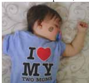
Abi after Pride