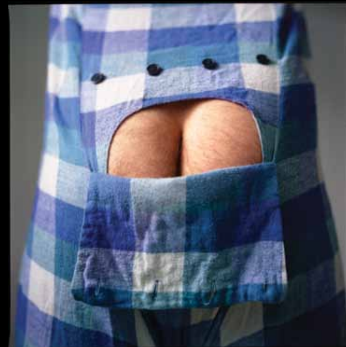
Untitled (trapdoor), 2002 / chromogenic print, 2008, 24" x 24"