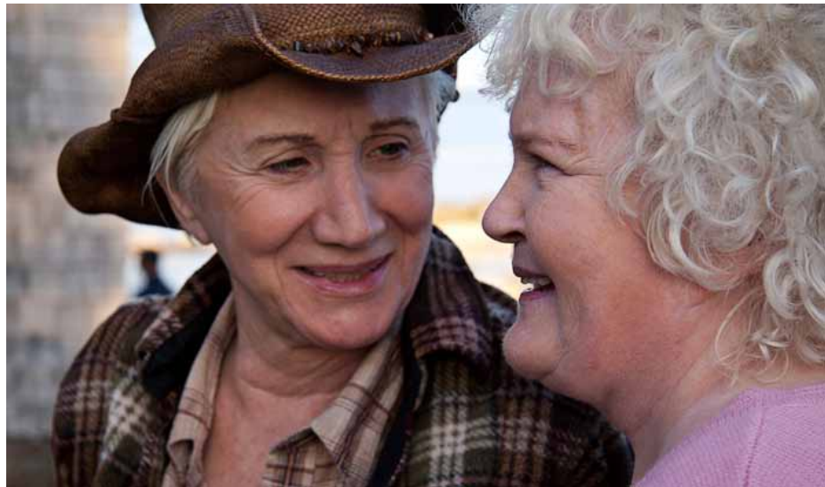
Olympia Dukakis and Brenda Fricker in a scene from Cloudburst . and British Columbia. GLBT and mainstream audiences alike have responded to the film's feisty humour and universal story of an aging romance.

Cloudburst stars Oscar winning actresses Olympia Dukakis and Brenda Fricker as an elderly lesbian couple who drive from the U.S. to get legally married in Canada. The film marks the first time two Oscar winning actors have played a same-sex couple onscreen. Since winning the Audience Award for Best Film at its Atlantic Film Festival debut, Cloudburst has been a big hit on the worldwide film festival circuit, garnering another 25 Best Picture Awards from such exotic locales as Athens, Atlanta, Barcelona, Hannover, Milan, New Zealand, San Francisco and many more. The crowd-pleasing film took festival prizes from coast to coast across Canada, here in Nova Scotia, Quebec, Ontario, Alberta