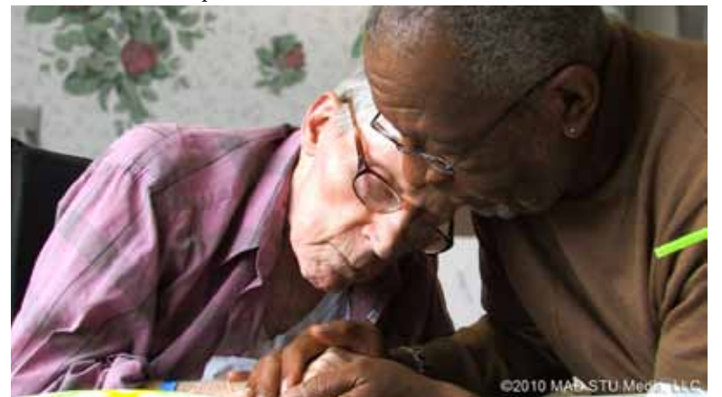
Scene from Gen Silent .

The screening was open to the public and about 50 non-students were present as well, including 8 LGBTQ community mentors who stayed after the screening to join in the discussions. In these the students explored the implications of what they had viewed in both the film and the audience discussion that followed.